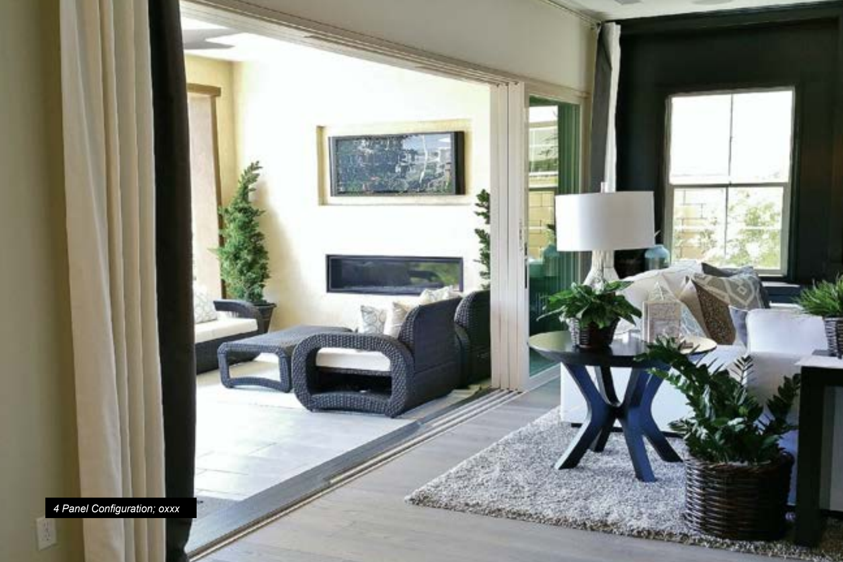
4 Panel Configuration; oxxx