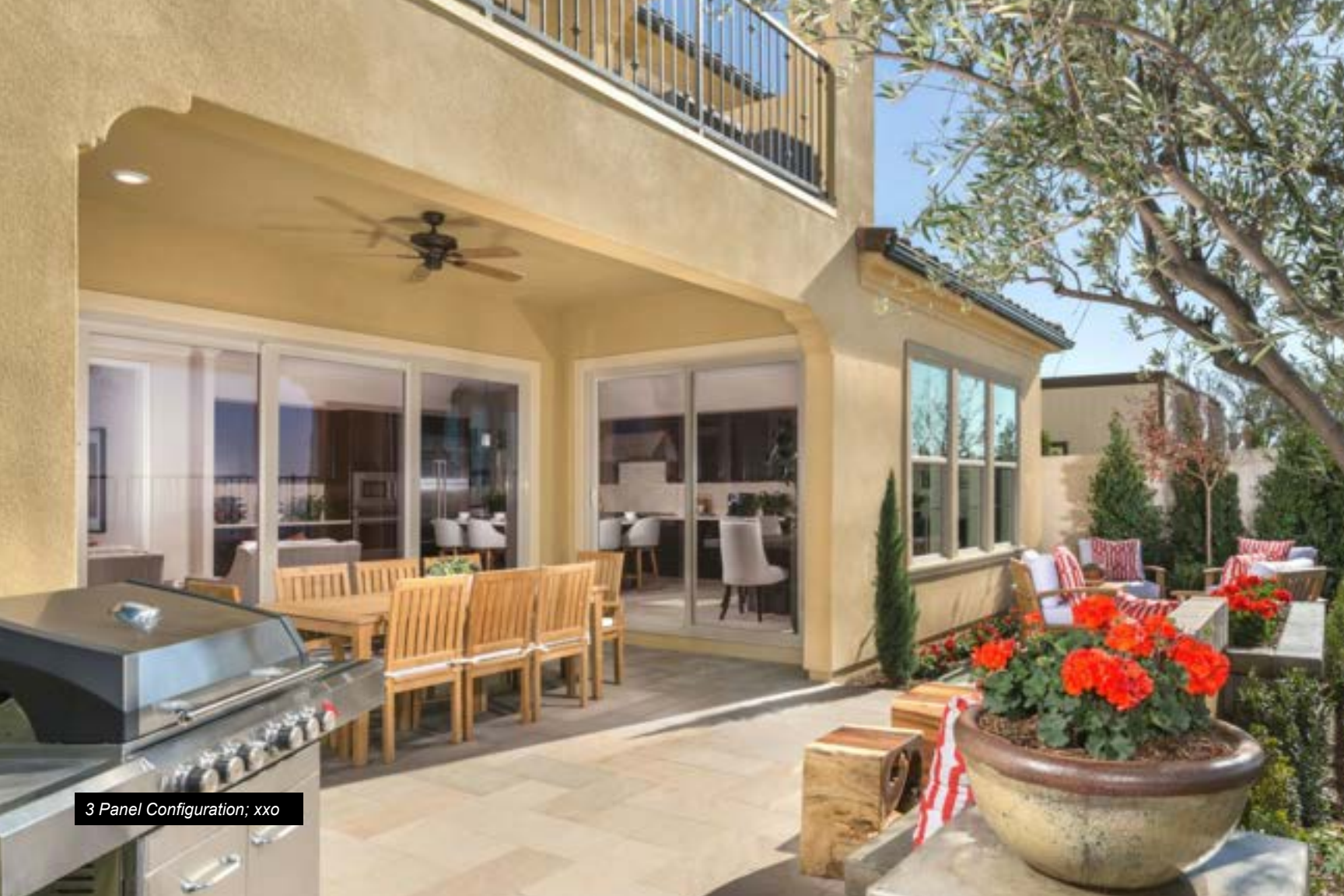
3 Panel Configuration; xxo