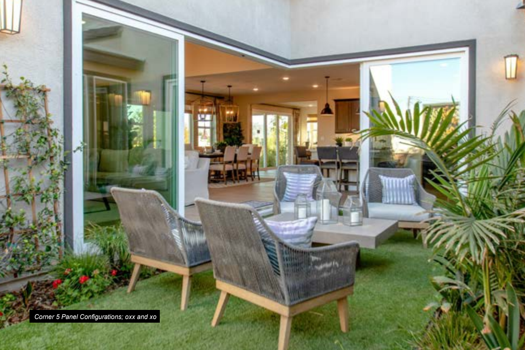
Corner 5 Panel Configurations: oxx and xo