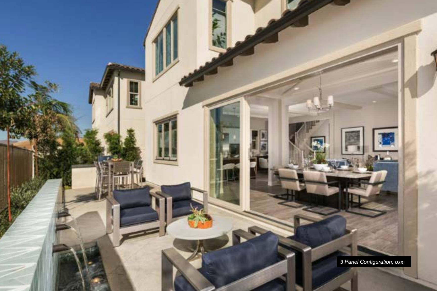
3 Panel Configuration; oxx