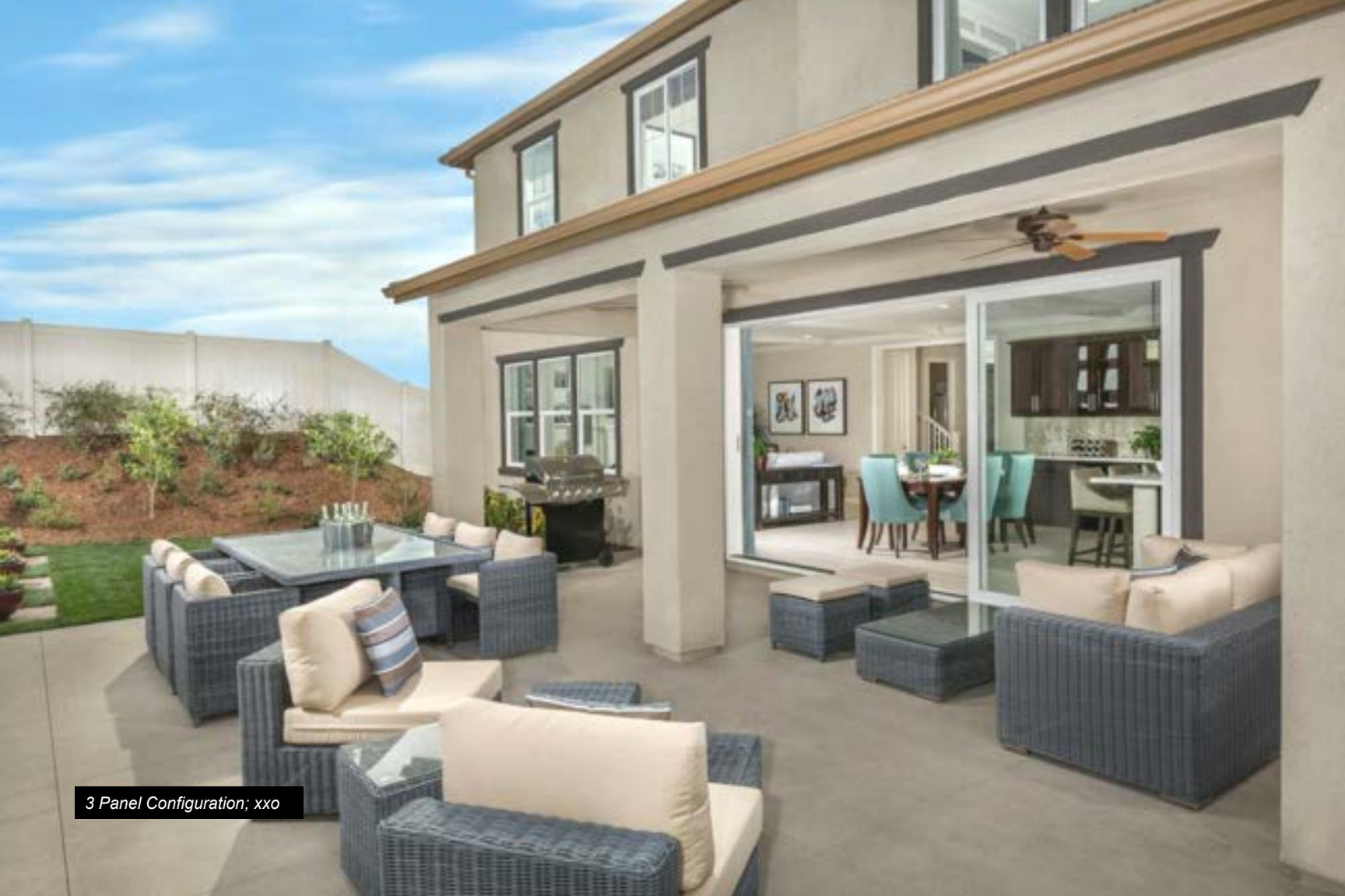
3 Panel Configuration; xxo