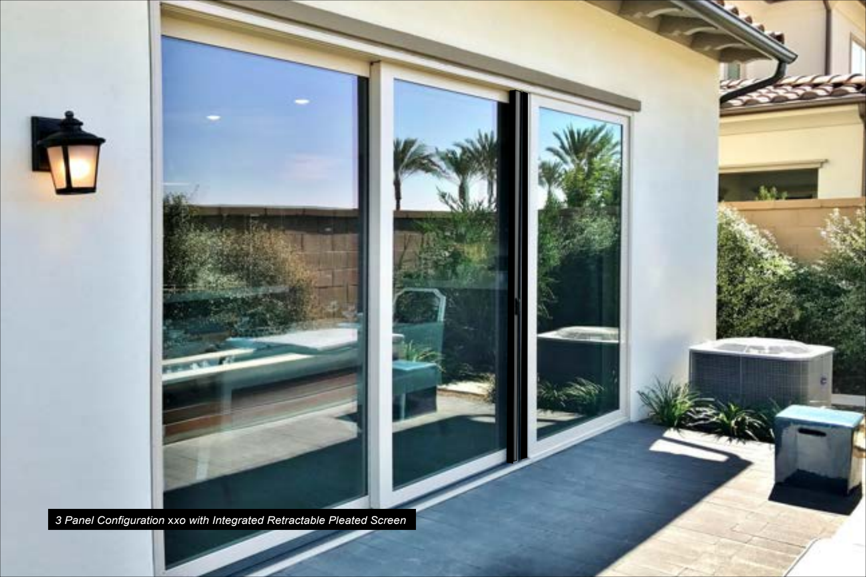
3 Panel Configuration xxo with Integrated Retractable Pleated Screen