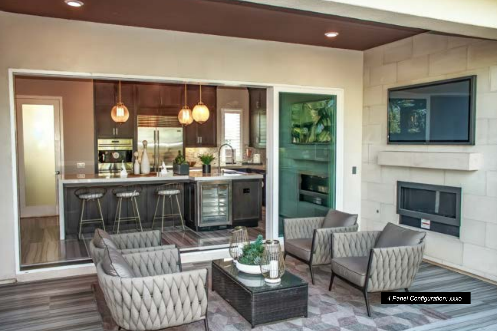
4 Panel Configuration; xxxo