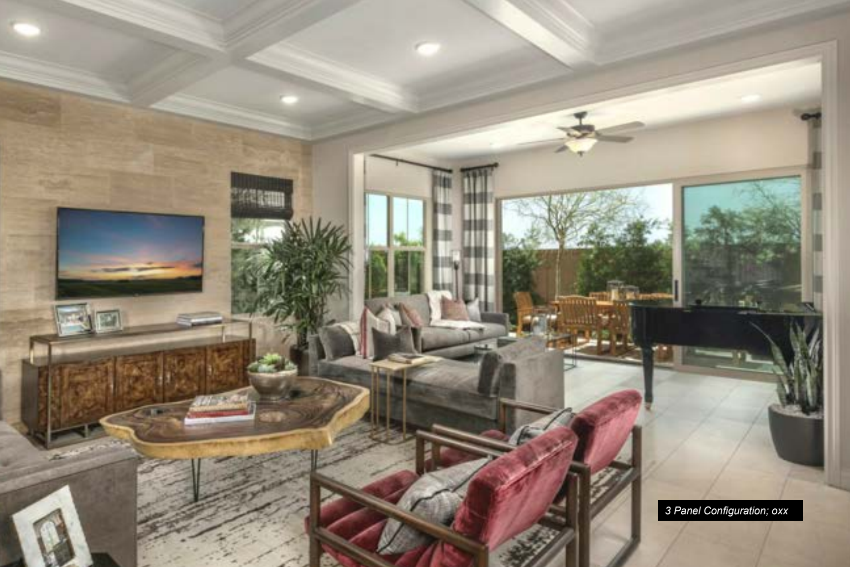
3 Panel Configuration; oxx