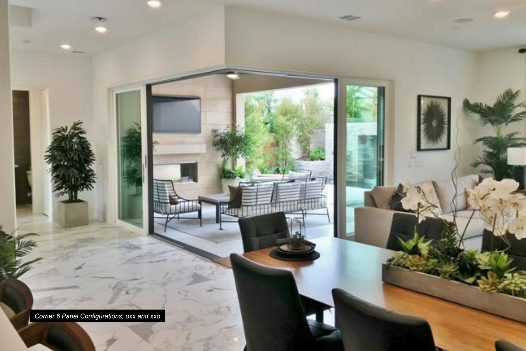
Corner 6 Panel Configurations; oxx and xxo