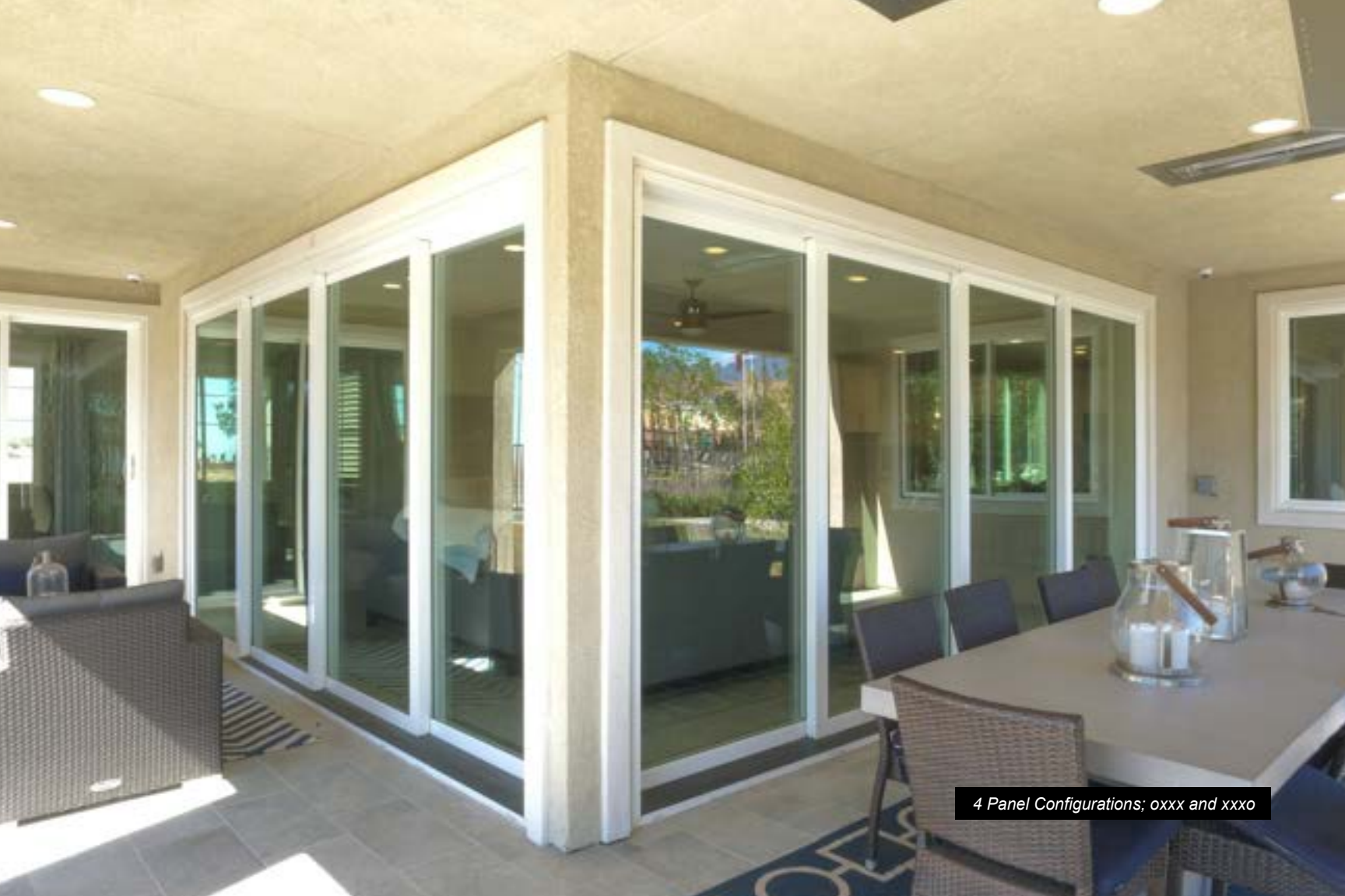
4 Panel Configurations; oxxx and xxxo