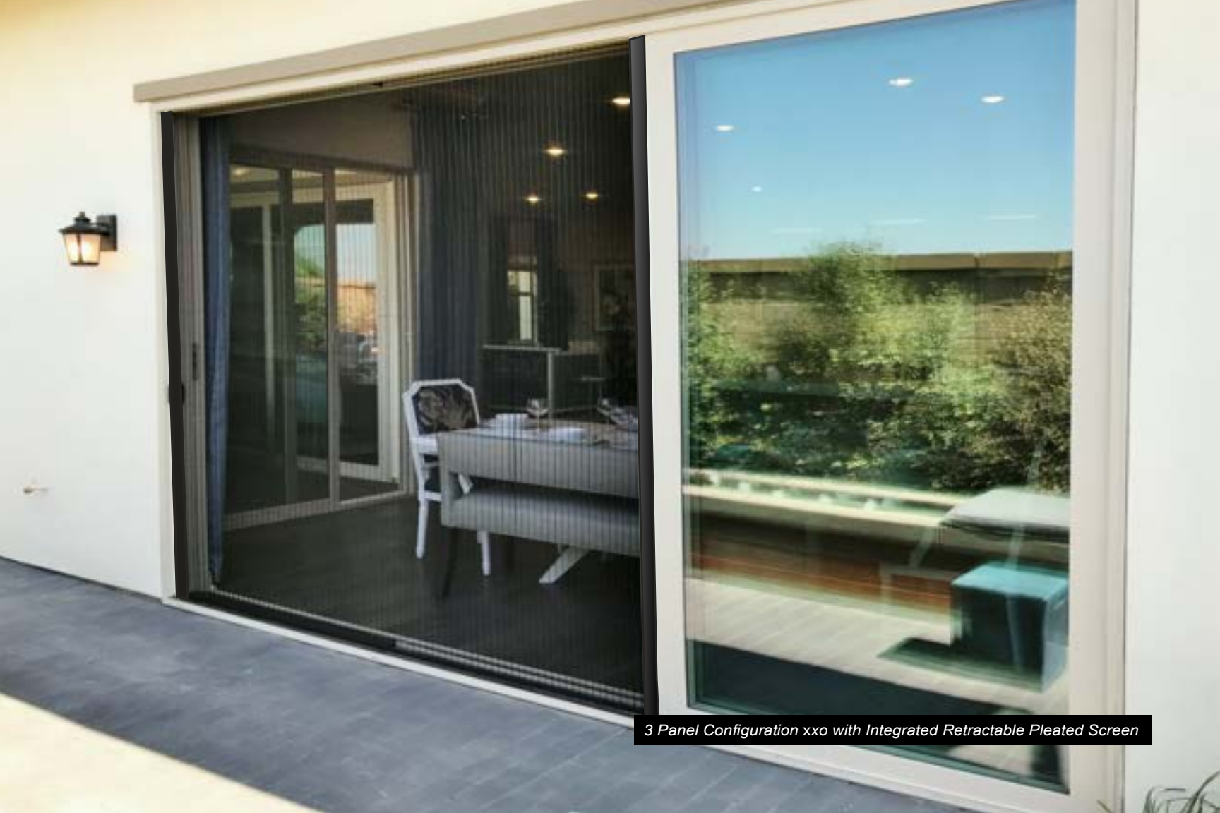
3 Panel Configuration xxo with Integrated Retractable Pleated Screen