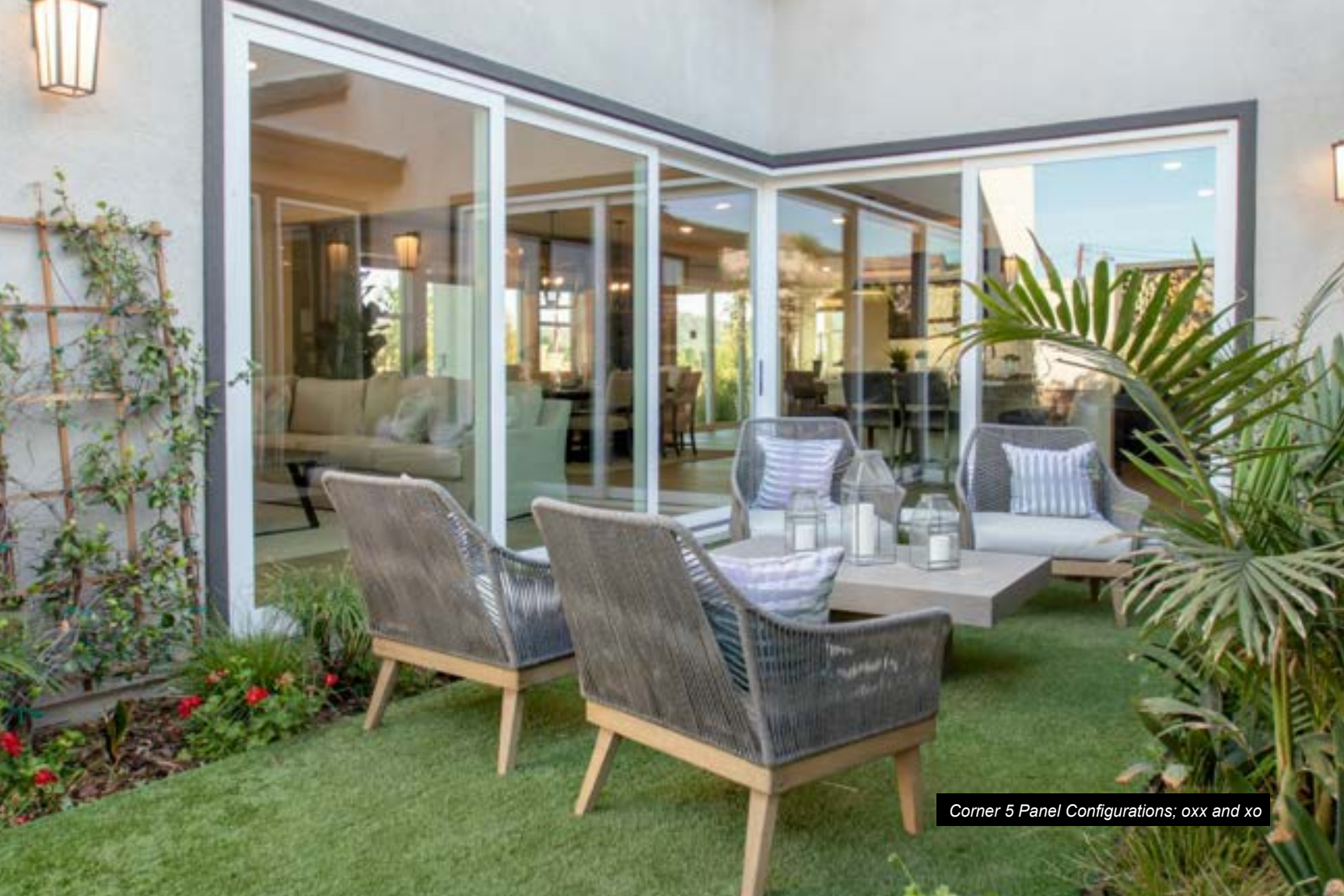
Corner 5 Panel Configurations; oxx and xo