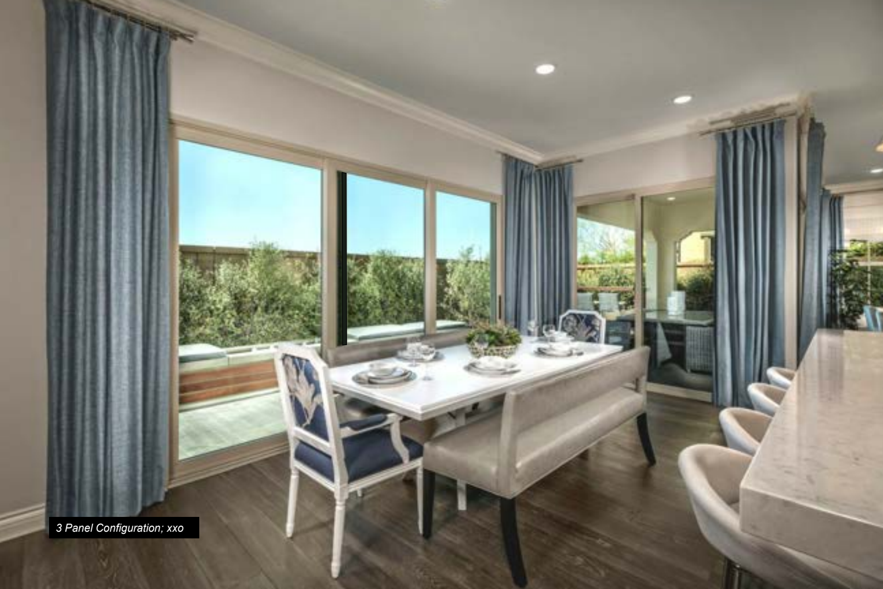
3 Panel Configuration; xxo