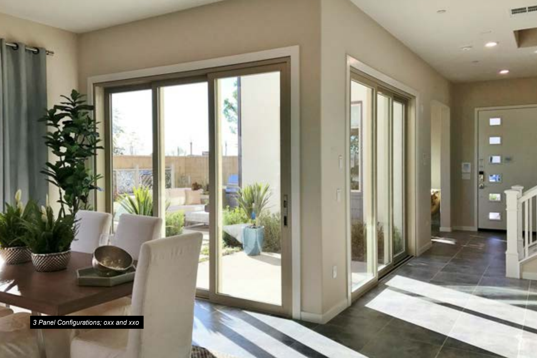
3 Panel Configurations; oxx and xxo