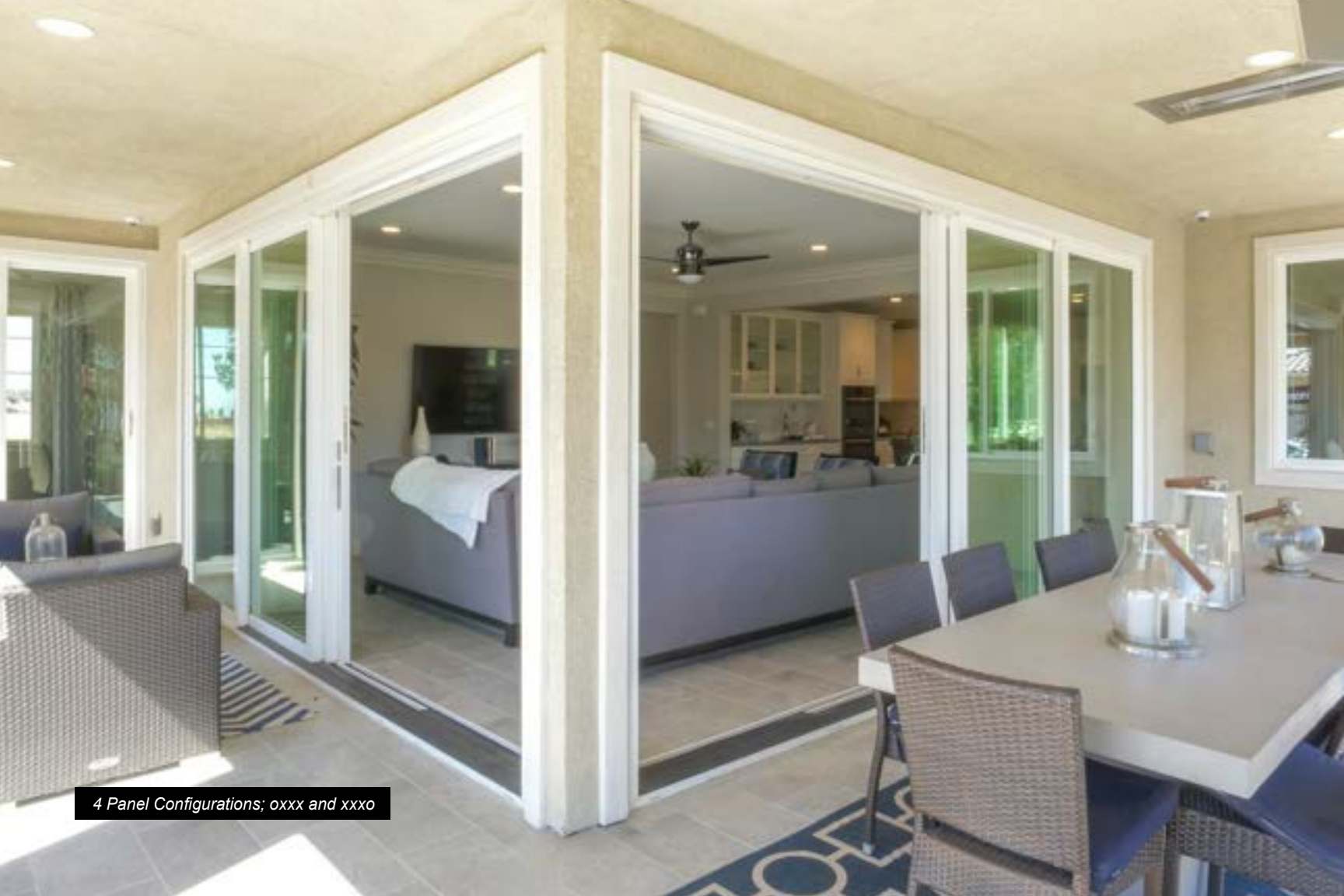
4 Panel Configurations: oxxx and xxxo