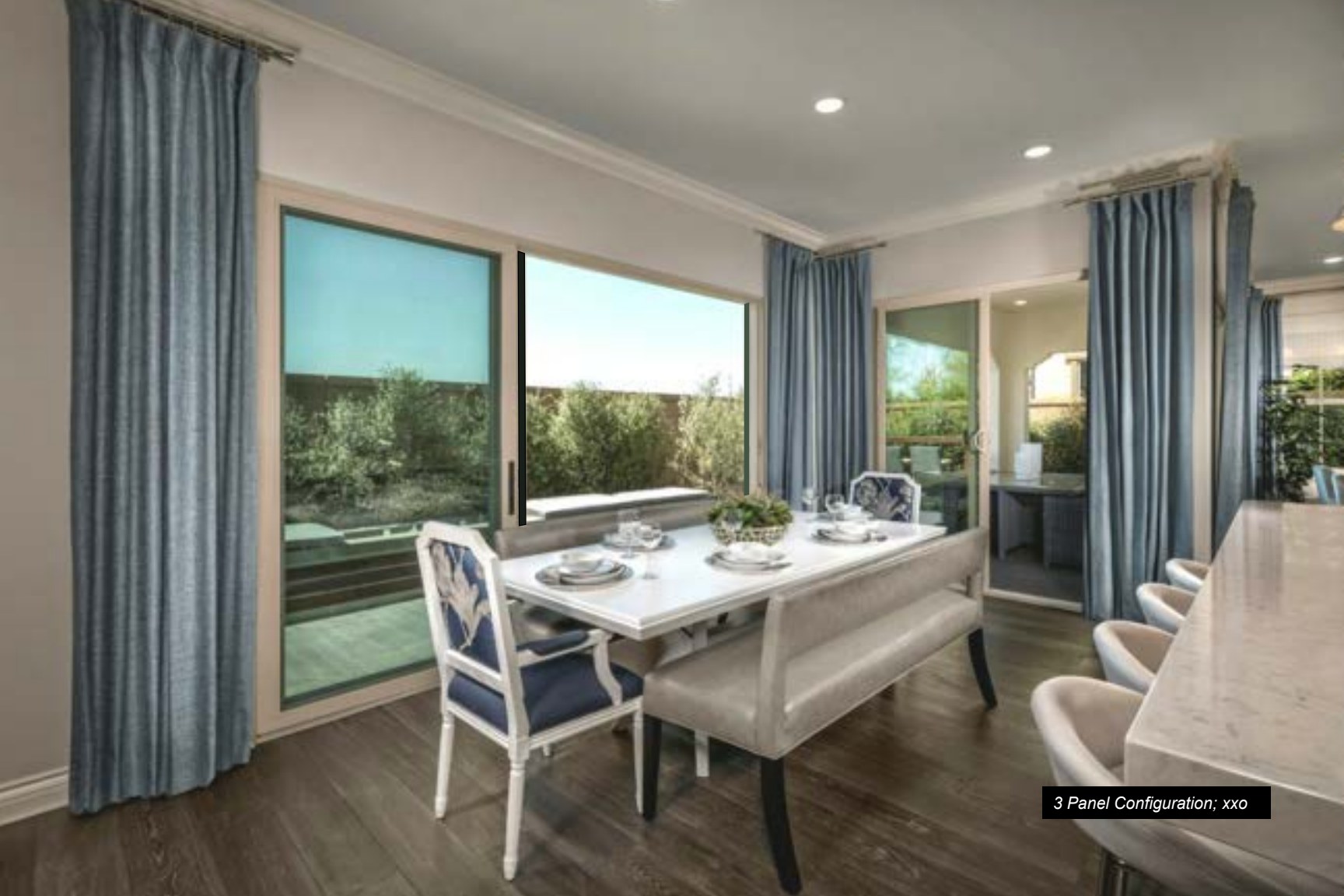
3 Panel Configuration; xxo