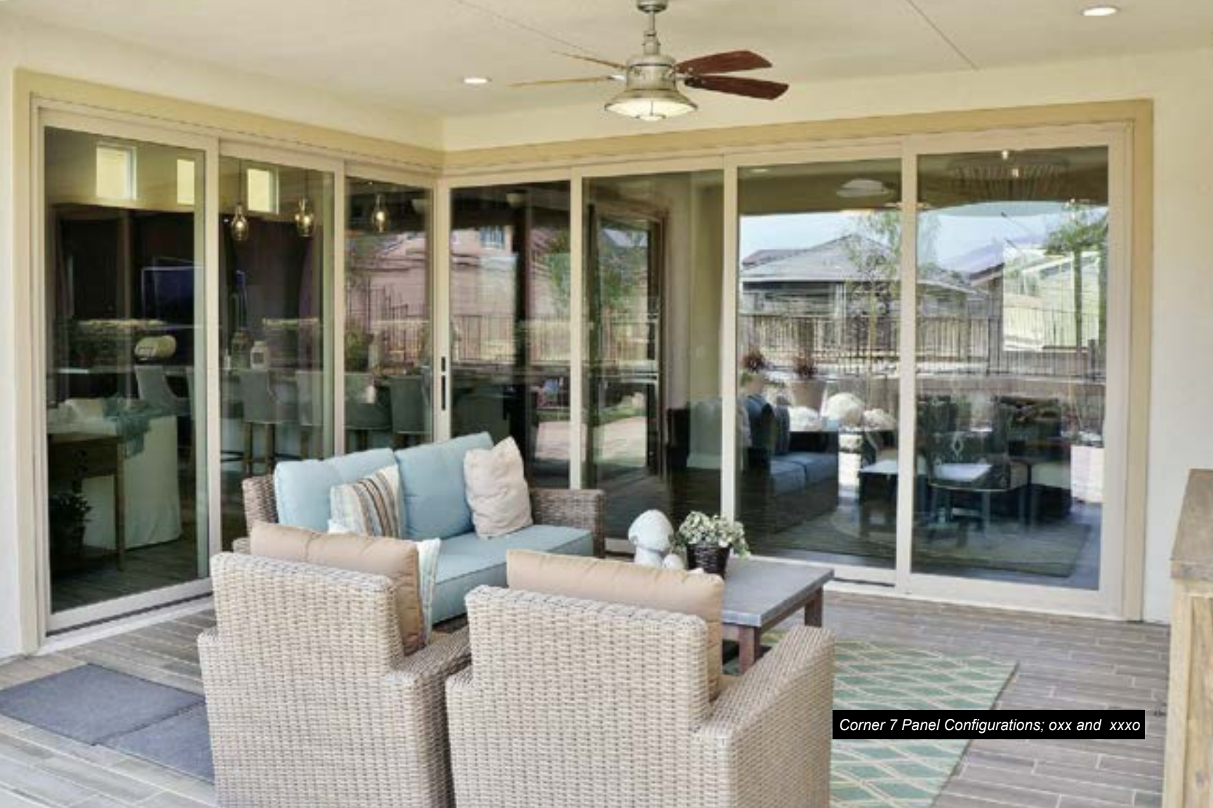
Corner 7 Panel Configurations; oxx and xxxo