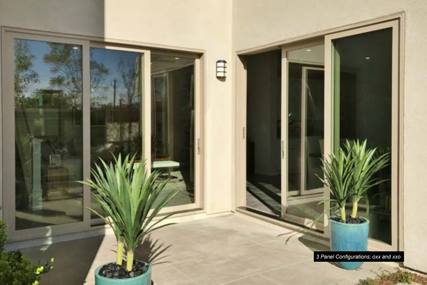
3 Panel Configurations; oxx and xxo