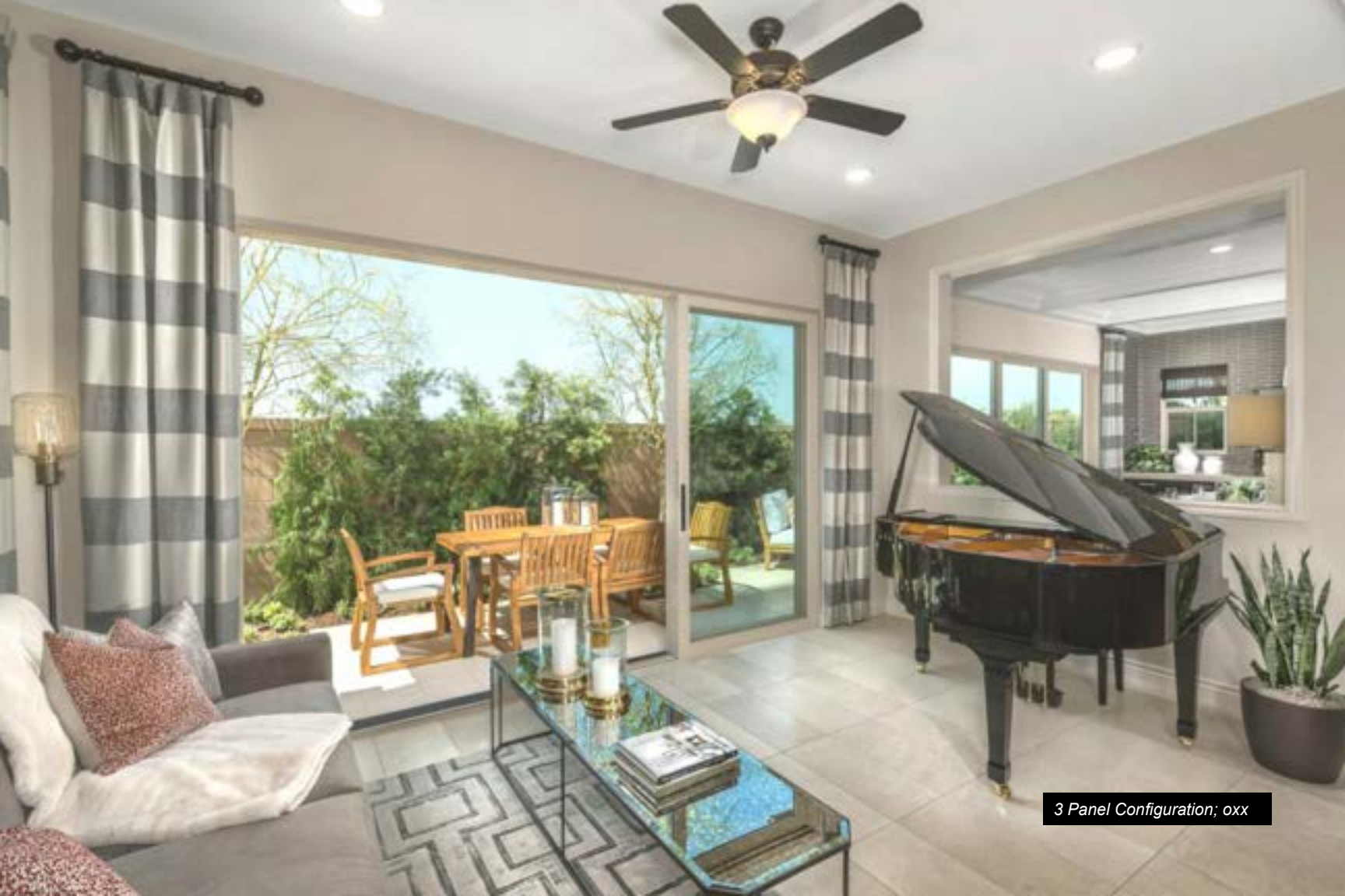
3 Panel Configuration; oxx