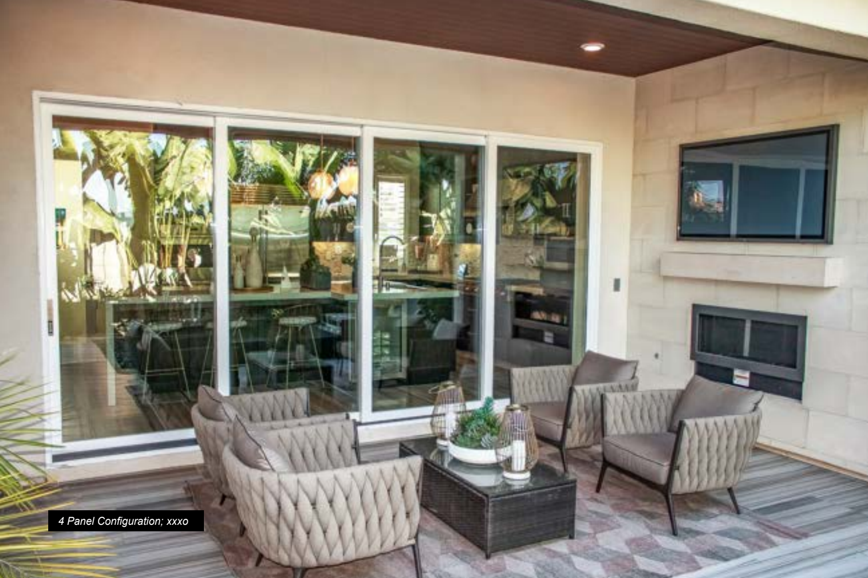
4 Panel Configuration; xxxo