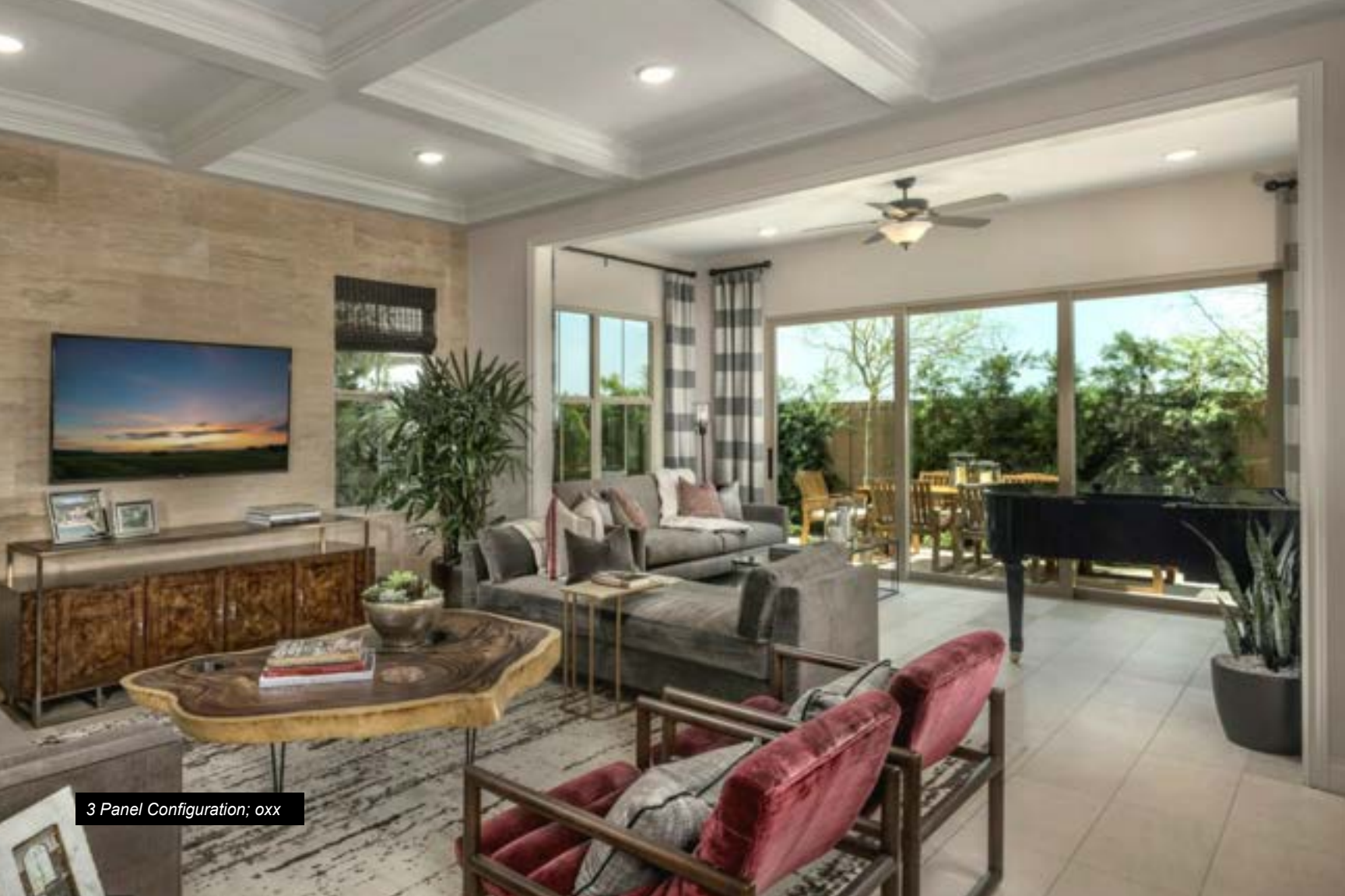
3 Panel Configuration; oxx