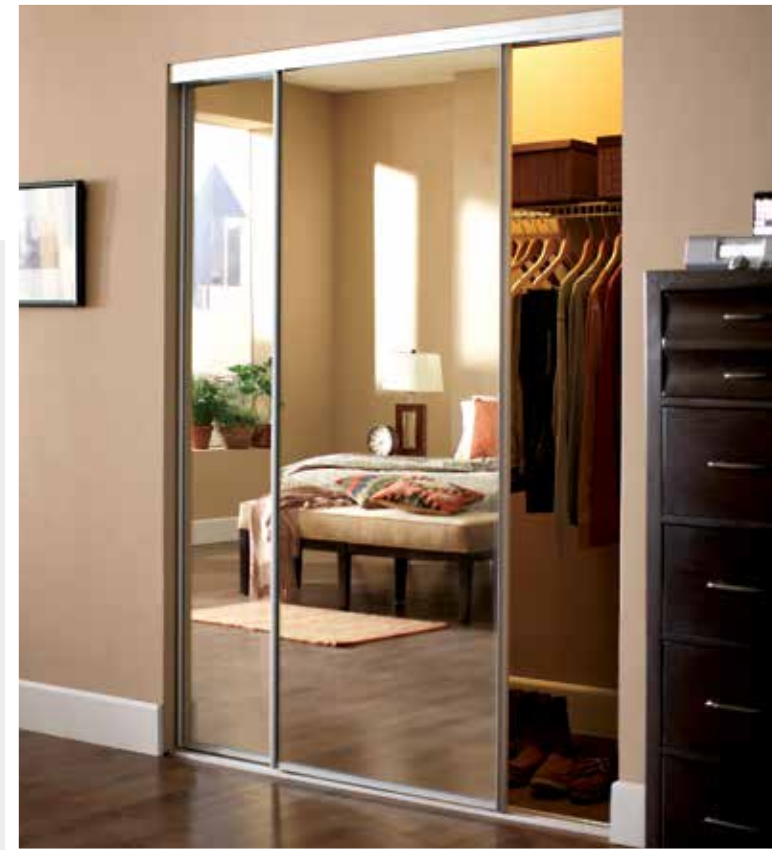
Pacifica® pictured in a Satin Clear finish