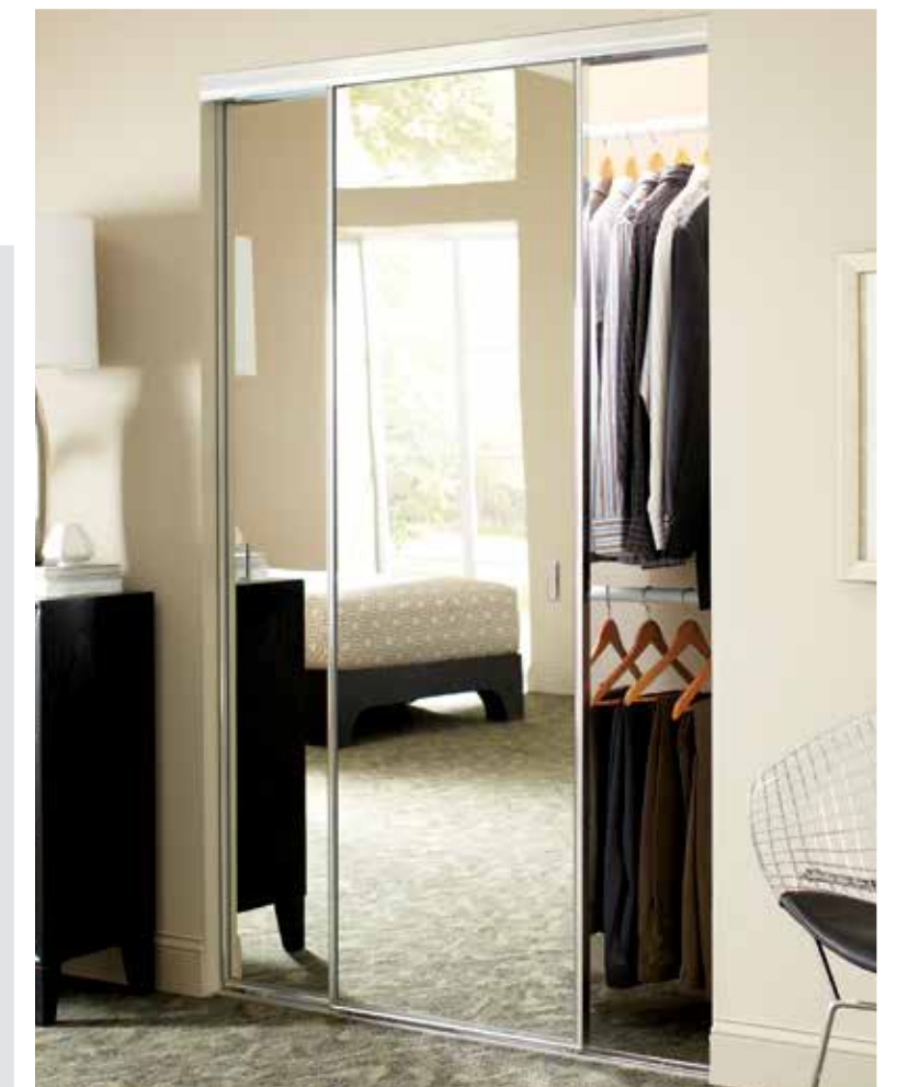
Aurora™ pictured in a Bright Clear finish