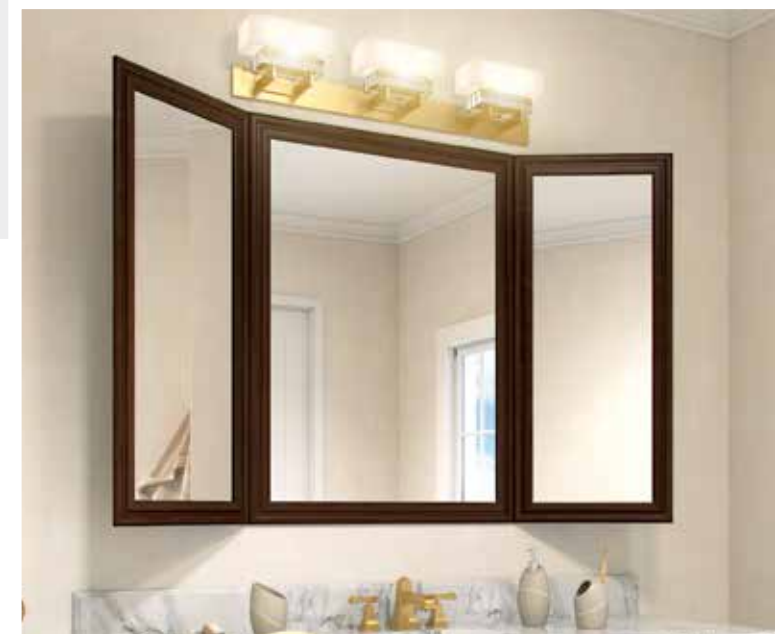
Oak Fantasy® Vanity Flair pictured in a Dark Stain finish