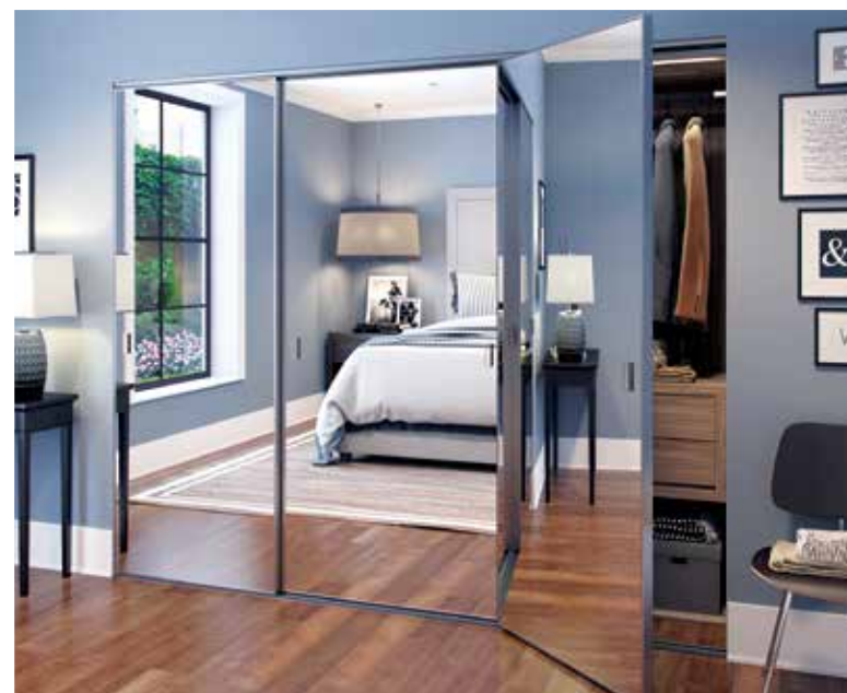
Trim Line® 3-Way Vanity pictured in a Bright Clear finish