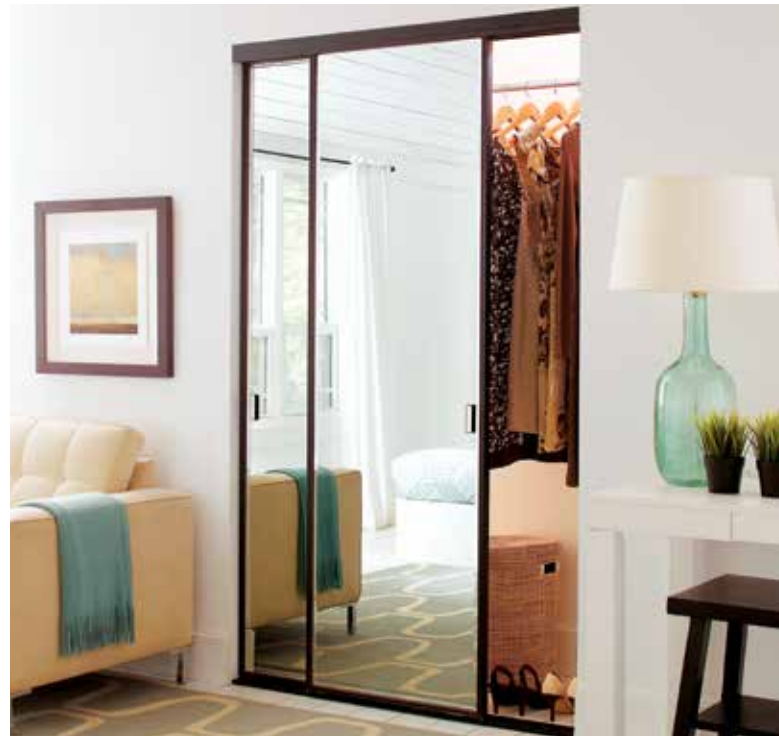
◆◆◆ Asprey® pictured in a Bronze finish with Clear Duraflect® copper-free mirror

Cw® Pompano Beach 1780 N.W. 15th Avenue, Suite 420 Pompano Beach, FL 33069