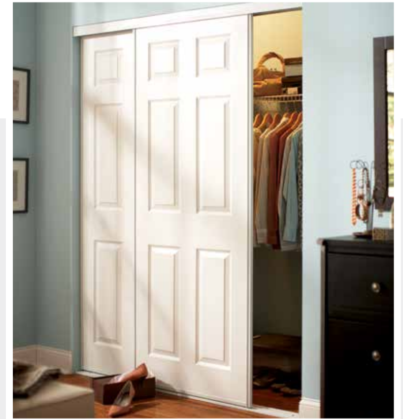
Colonial™ pictured in a Gloss White finish with raised 6 panel White hardboard