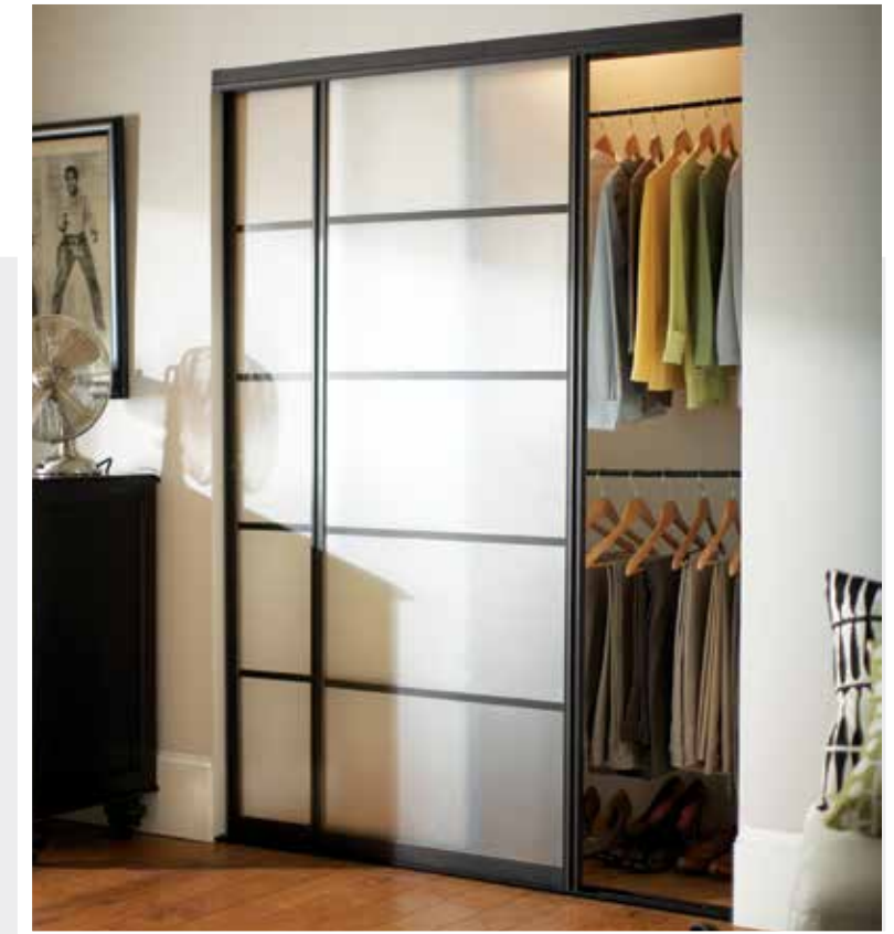
Silhouette® 5 lite equal pictured in a Bronze finish