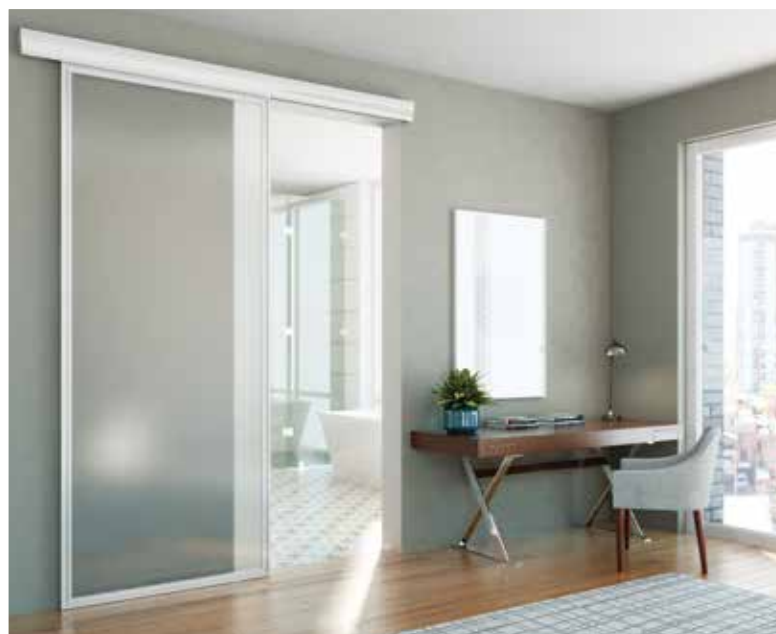
Picture of Sky® wall mounted application in a Satin Clear finish with Mystique™ Duratuf® tempered safety glass