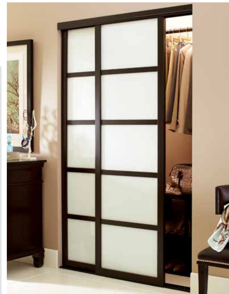
Tranquility™ 5 lite equal pictured in an Espresso finish