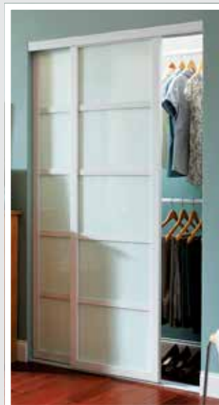
Tranquility® 5 lite equal in a White finish with Snow White back painted glass

True divided lite door patterns are an essential element for adding a defining characteristic to a wide range of styles. From elegant, old-world to arts and crafts and even the most minimalist, modern designs, true divided lite offers a multitude of panel configurations separated by our H-bar.