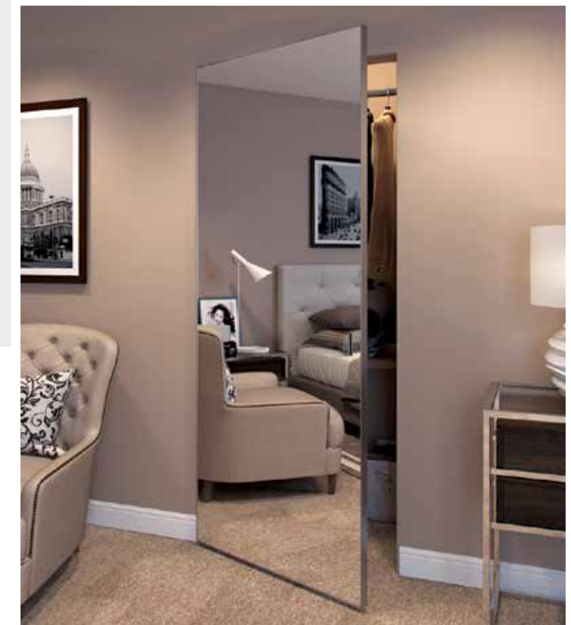
Style Lite® Walk-In pictured in a Brushed Nickel finish

Visit CwDoors.com for additional product photos and other products