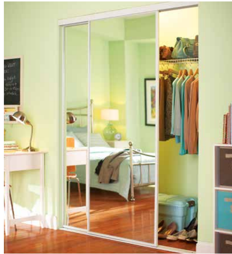
Savoy™ pictured in a Gloss White finish