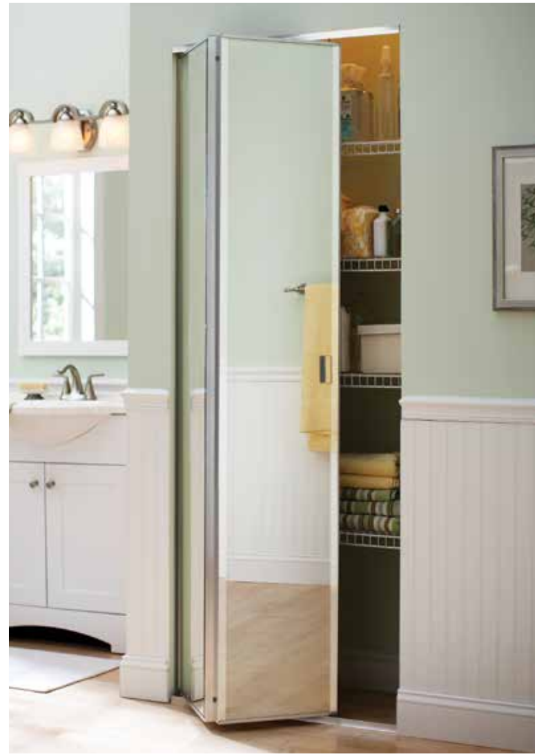
Trim Line® Bi-Fold pictured in a Bright Clear finish with 1" bevel on vertical edges

On the cover: ◆◆◆ Eclipse® pictured in a Satin Clear finish with Mystique™ Duratuf® tempered safety glass