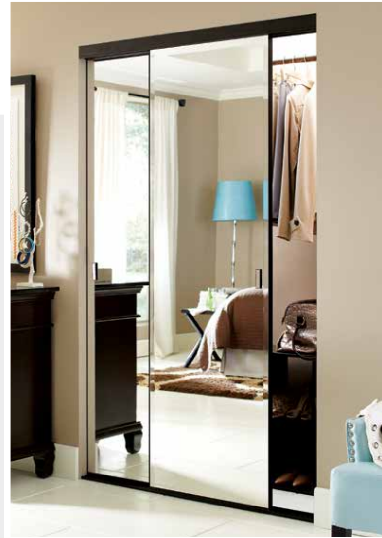
Trim Line® pictured in a Bronze finish with 1" bevel on vertical edges