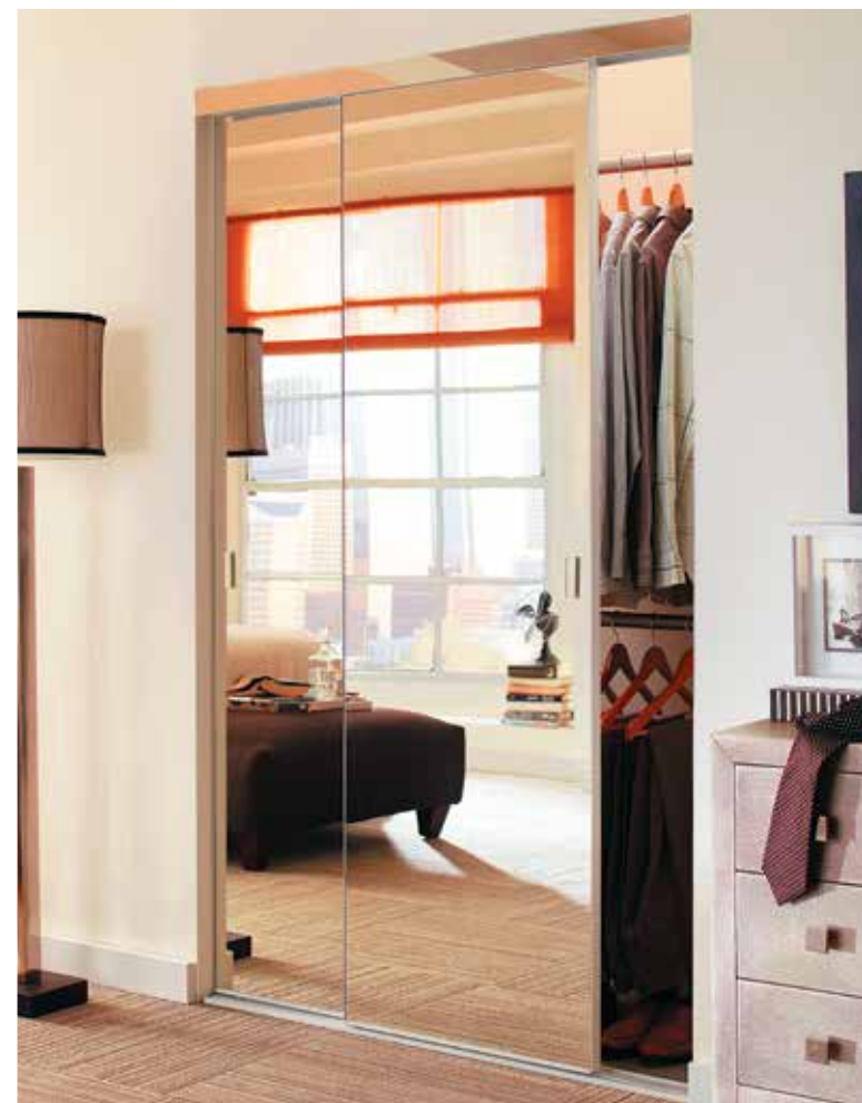
Brittany® pictured in a White finish with matching mirror fascia