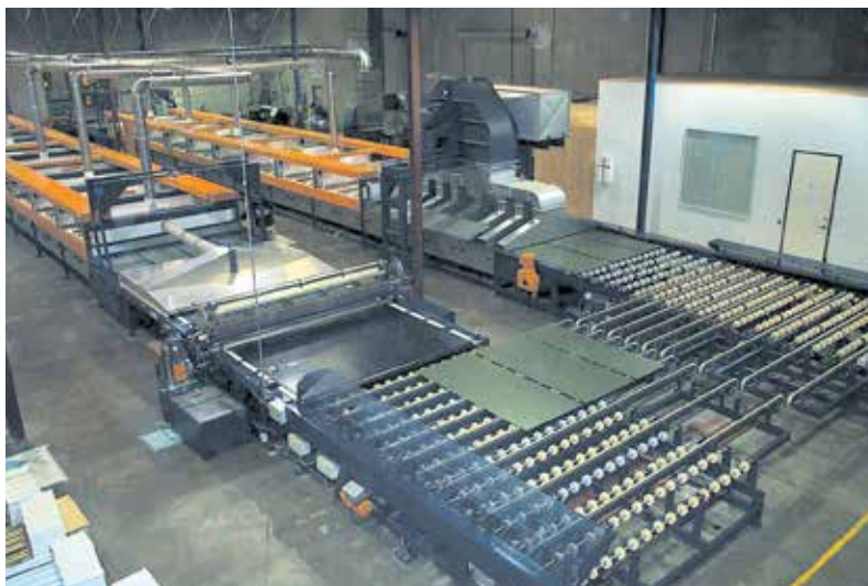
Picture of Contractors Wardrobe®'s Klöpper Mirror Conveyor — located in Sacramento, California. The efficiencies of the line along with the "Copper-Free" chemical solution are environmentally friendly and improve the quality and life of the mirror.

Our patented process is a quantum leap in mirror manufacturing. Contractors Wardrobe® is the first in the United States to exclusively manufacture copper-free mirror.